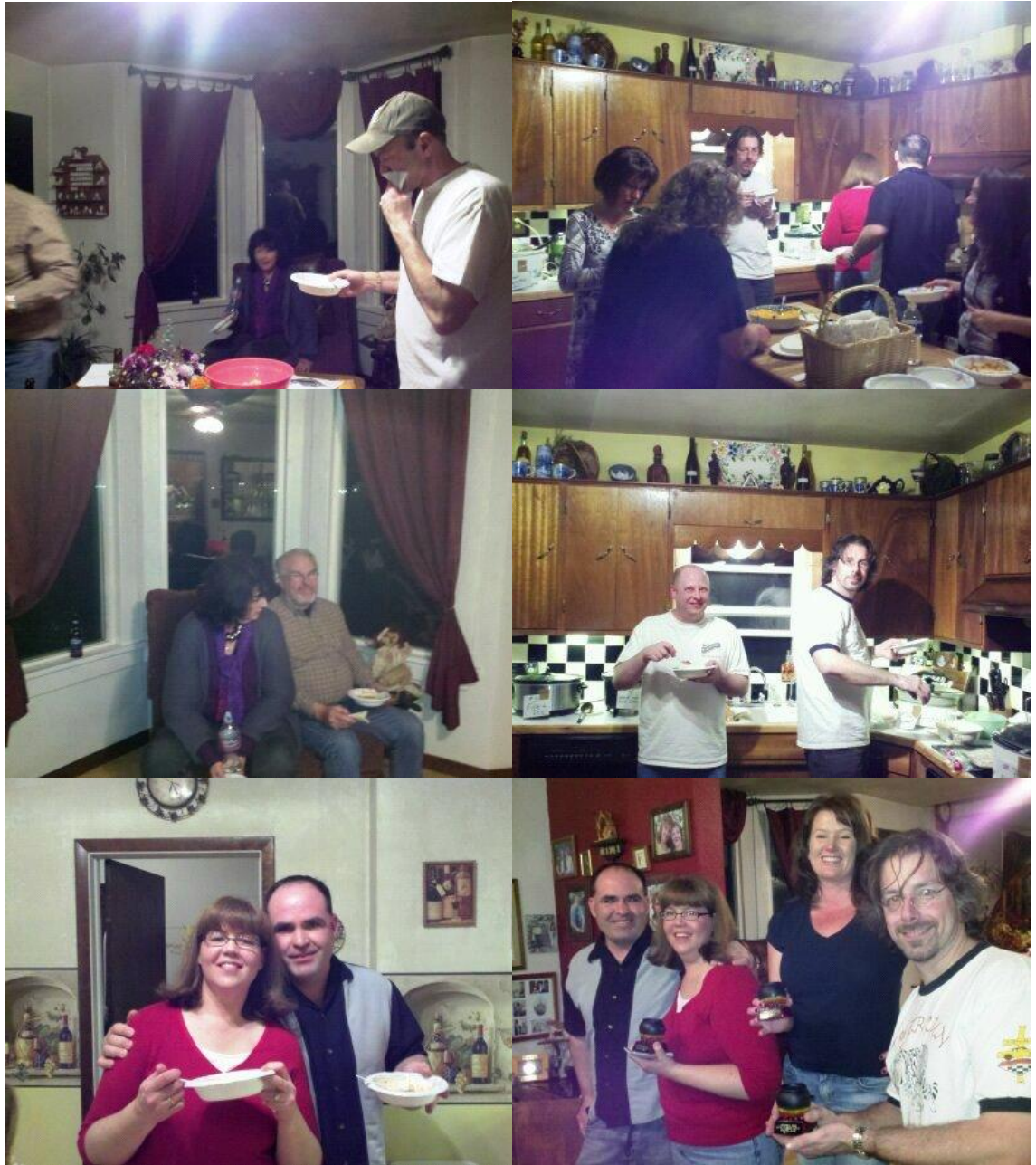
3rd Place 1st Place 2nd Place

PLEASE SEE PAGE 7 FOR DETAILS ON ALL UPCOMING EVENTS!