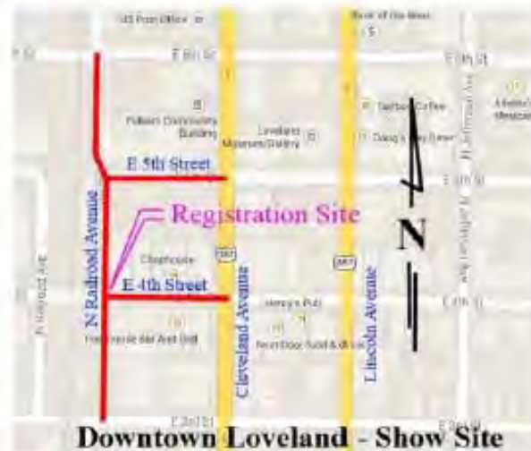
Downtown Loveland - Show Site